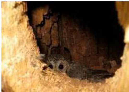
M Seidensticker photo